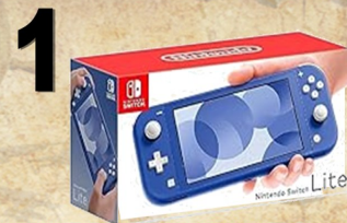
NINTENDO SWITCH LITE