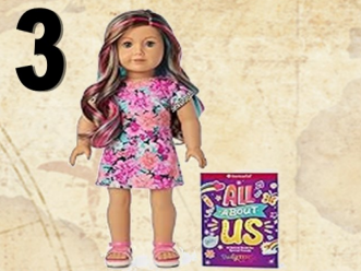
AMERICAN GIRL DOLL