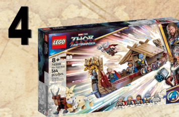
LEGO THOR SHIP